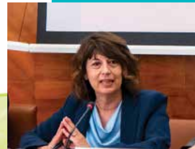
Roberta Angelilli Vice President, Lazio Region